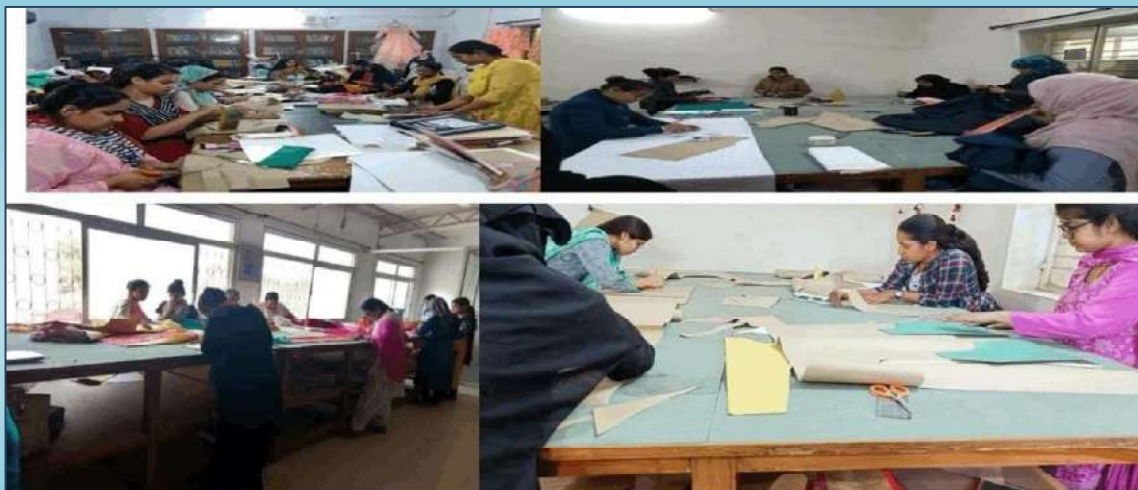
Fashion Design students learning creativity with precision at the Pattern Making Lab.

The pattern-making lab is stocked with specialised pattern-making tables and dress forms. Pattern making is the art of designing patterns. It involves the design and creation of templates for the basic garment formation. Course disciplines imparting inputs in apparel design & apparel technology, maintain pattern making & draping labs.