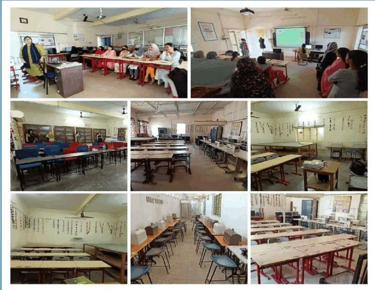
Classrooms—Enabling Interactive and Engaging Education

In terms of infrastructure, the department is maintaining standards. It has upgraded its classrooms to facilitate teaching through modern tools and techniques. The department has neat and clean classrooms with Wi-Fi-enabled LCD projectors, tutorial rooms, a library section and a resource centre. The college is also equipped with full connectivity, high-speed Wi-Fi, and the campus CCTV-enabled to cater to the safety requirements. A Wi-Fi-enabled campus is accessed by students and staff members.