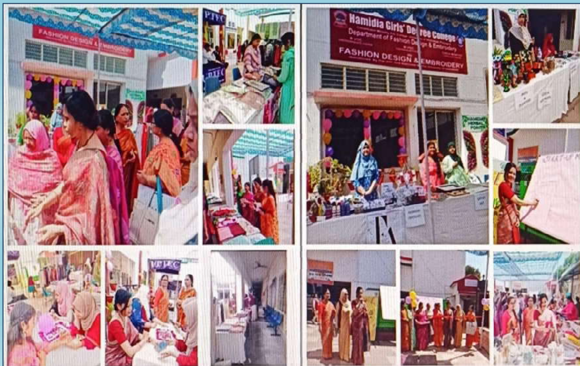
Start-up Mela held on 5th and 6th March 2024