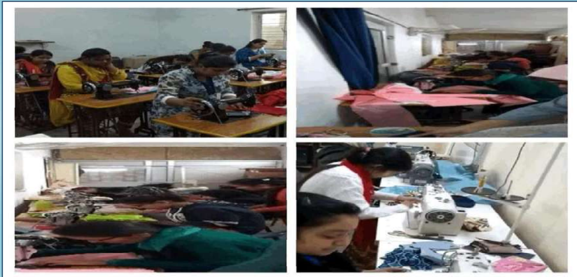
Where Creativity Takes Shape: Garment Construction Lab PATTERN